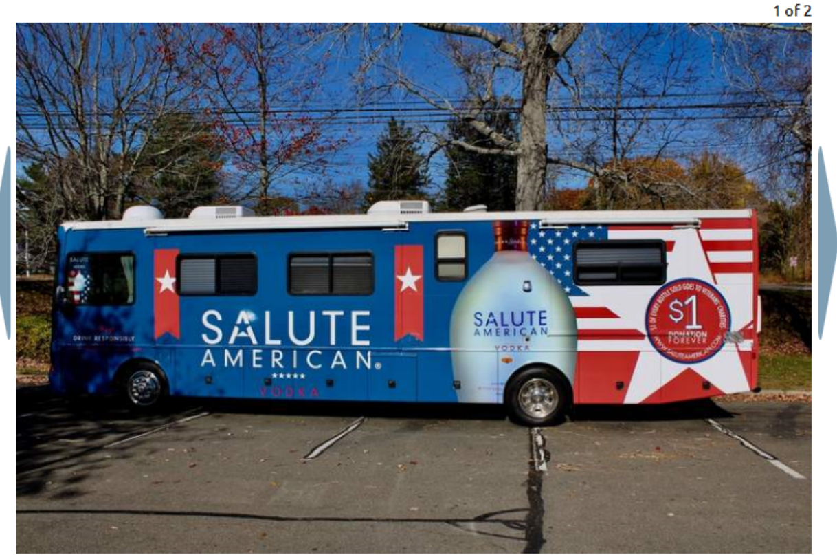
Salute American Vodka is hosting a launch party Friday, April 21 at Anna Liffey's in New Haven. The company also has launched a fundraiser for veterans.

Published April 20, 2017. Last updated 03:45 p.m., April 17, 2017